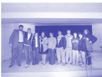
EYC at Feast of Lights

We're always posting cool stuff and awesome pictures!