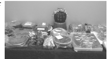
Holy Home Cookin' Table